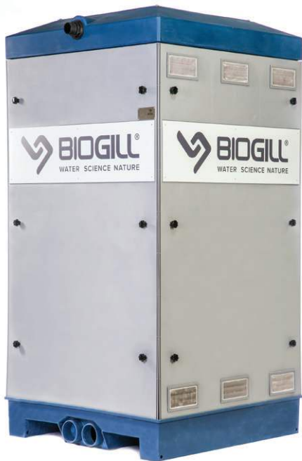
Figure 1. BioGill® Tower

Unlike traditional systems, the BioGill Tower does not require blowers or powered aeration, resulting in significant savings.